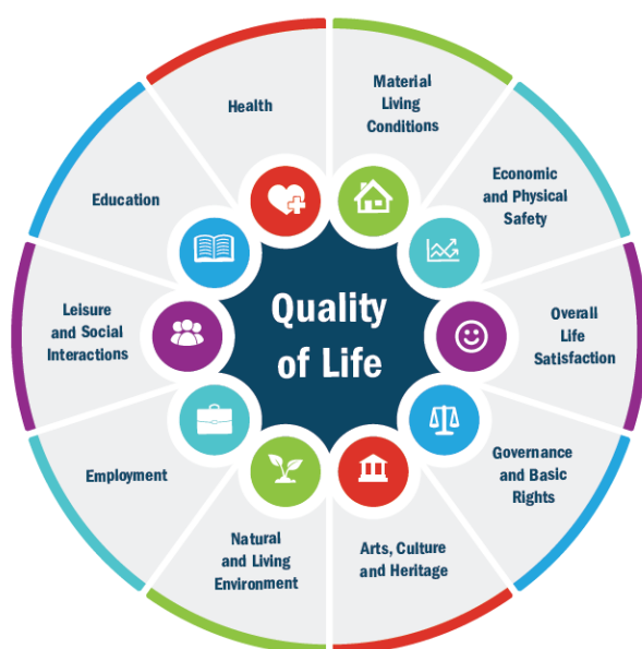
Figure 6.1 | Elements Supporting Quality of Life