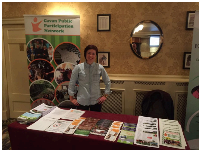
PPN Members attend JPC Linkage Group Meetings to discuss crime prevention and safety issues concerning County Cavan.