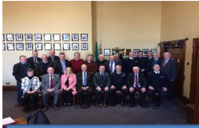
Members of the County Cavan Joint Policing Committee

Cavan Joint Policing Committee held quarterly meetings over 2018 in February, May, September and December. Some of the key topics under focused on included: