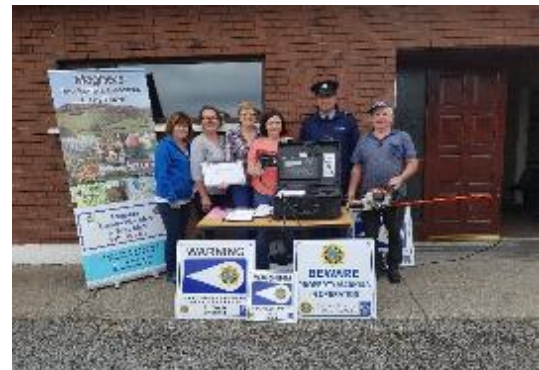
Members of Maghera Community Alert