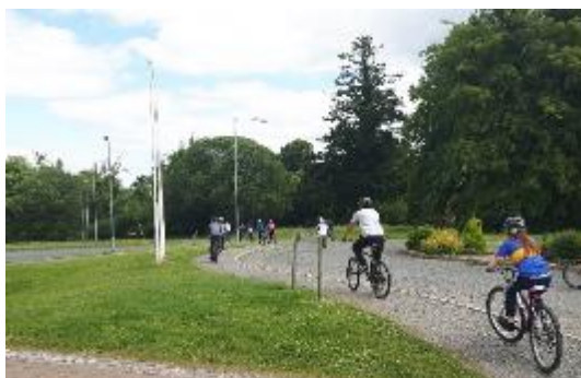
DB Cycling Club Family Fun