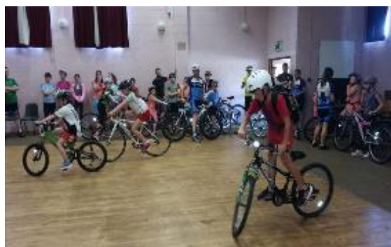
Smugglers Cycling Club from Ballyconnell providing their local cycling enthusiasts with a fun cycle and bike skills