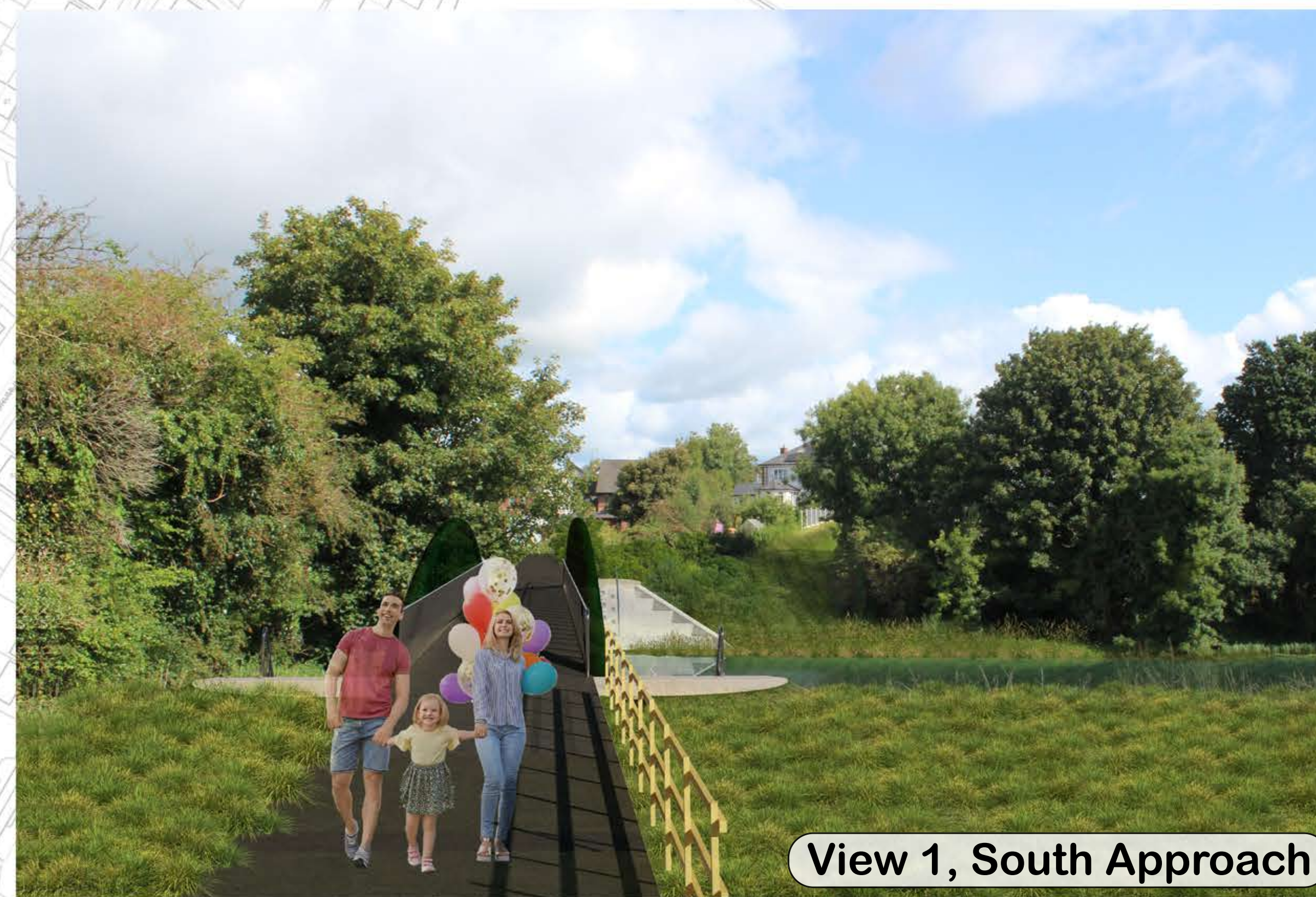
View 1, South Approach

The scheme proposes a new shared pedestrian and cycle path and access road commencing at Virginia Courthouse and extending northwards past the Virginia Handball Club. The road will provide access to the existing properties and the handball club including new parking bays. The scheme crosses the River Rampart via a single span arched truss bridge supported on seated abutments offset from the riverbank edge which maintains the existing riverbank public right away. The scheme continues northwards where it will tie into Rampart View infrastructure.