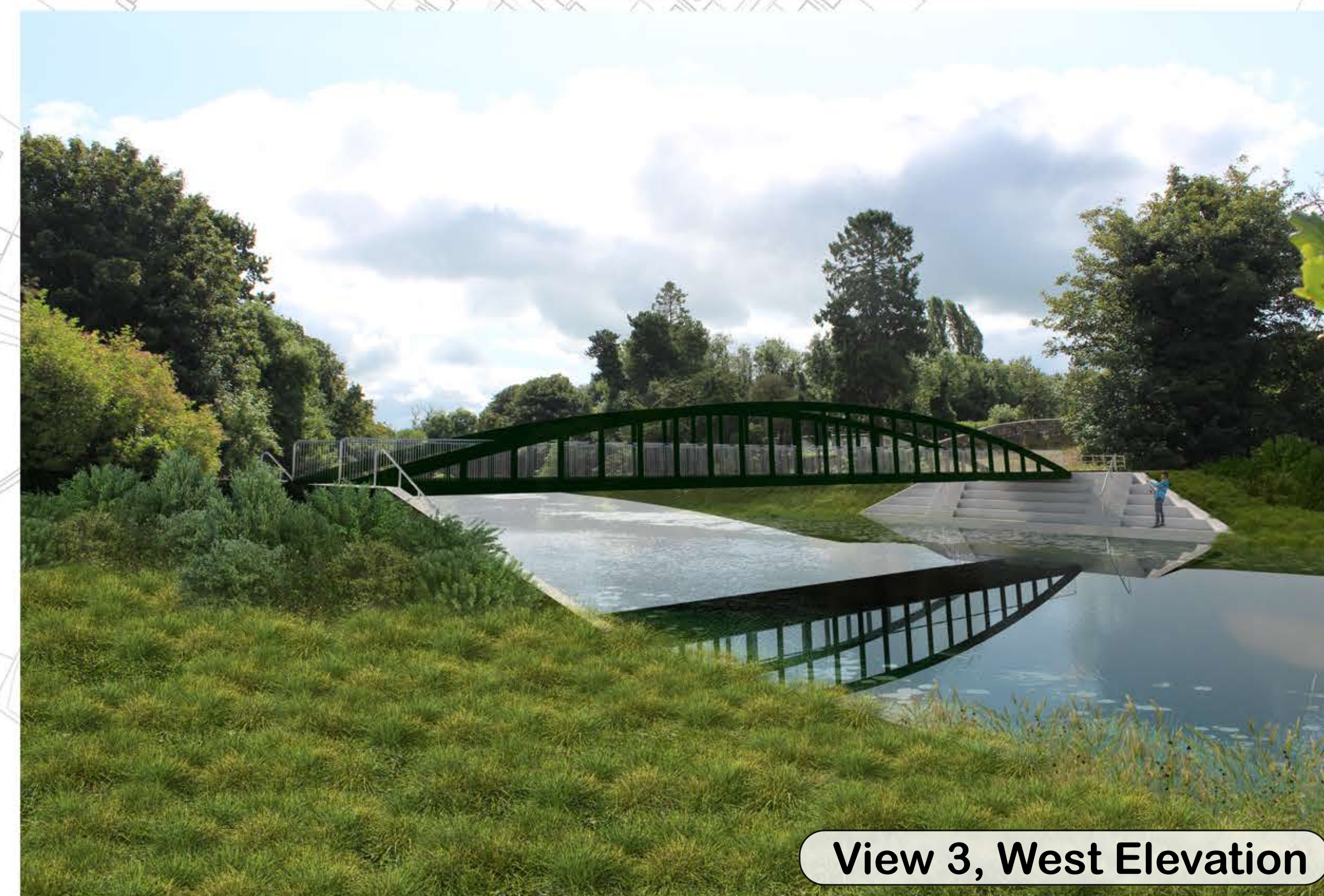
View 3, West Elevation