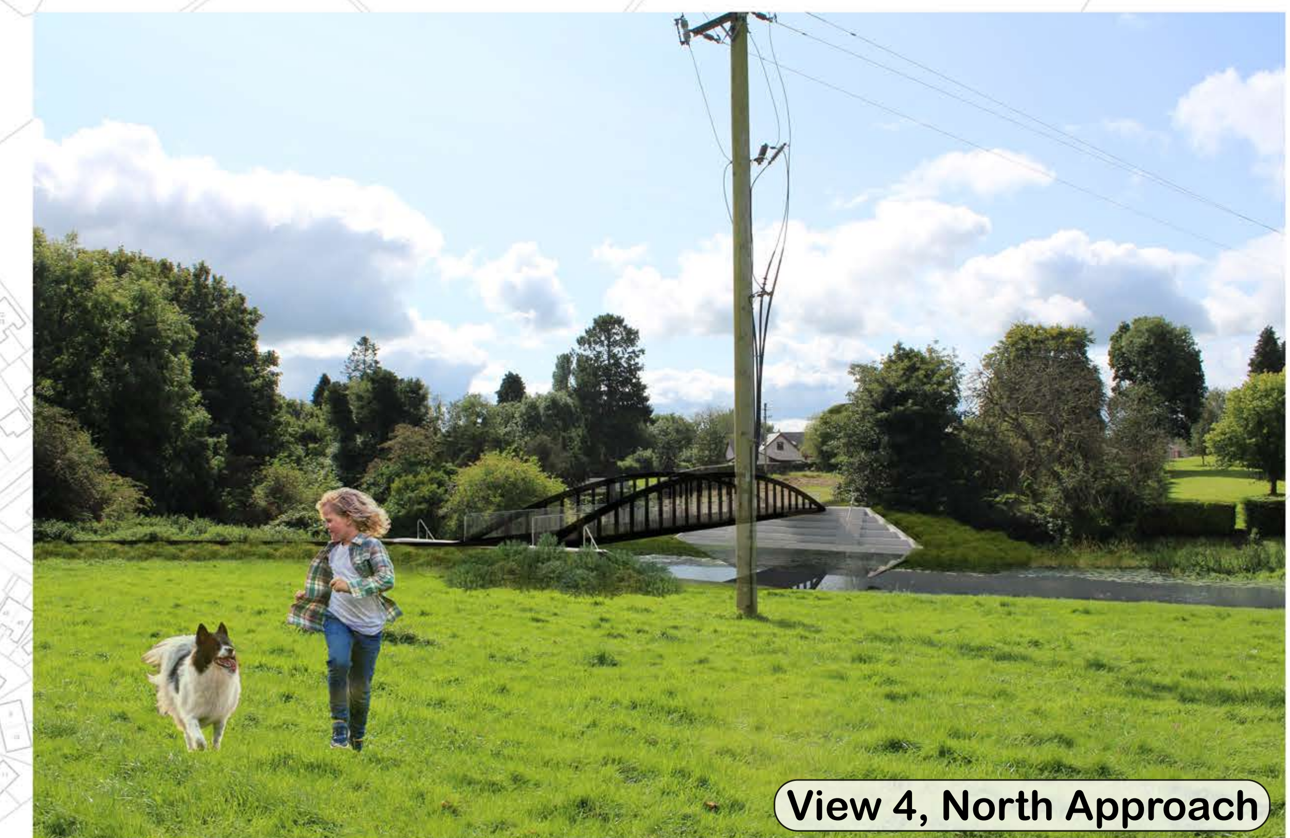
View 4, North Approach

As part of the scheme development, a Non-Statutory Public Consultation is now being carried out to allow members of the public an opportunity to review the current scheme and raise any comments.