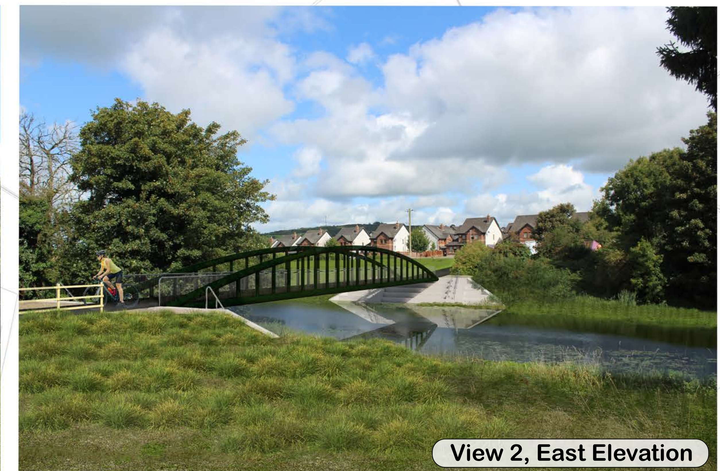
View 2, East Elevation