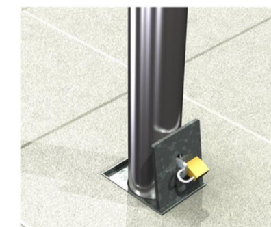
FT9. Removable Bollard (To be stainless steel / with visibility band).