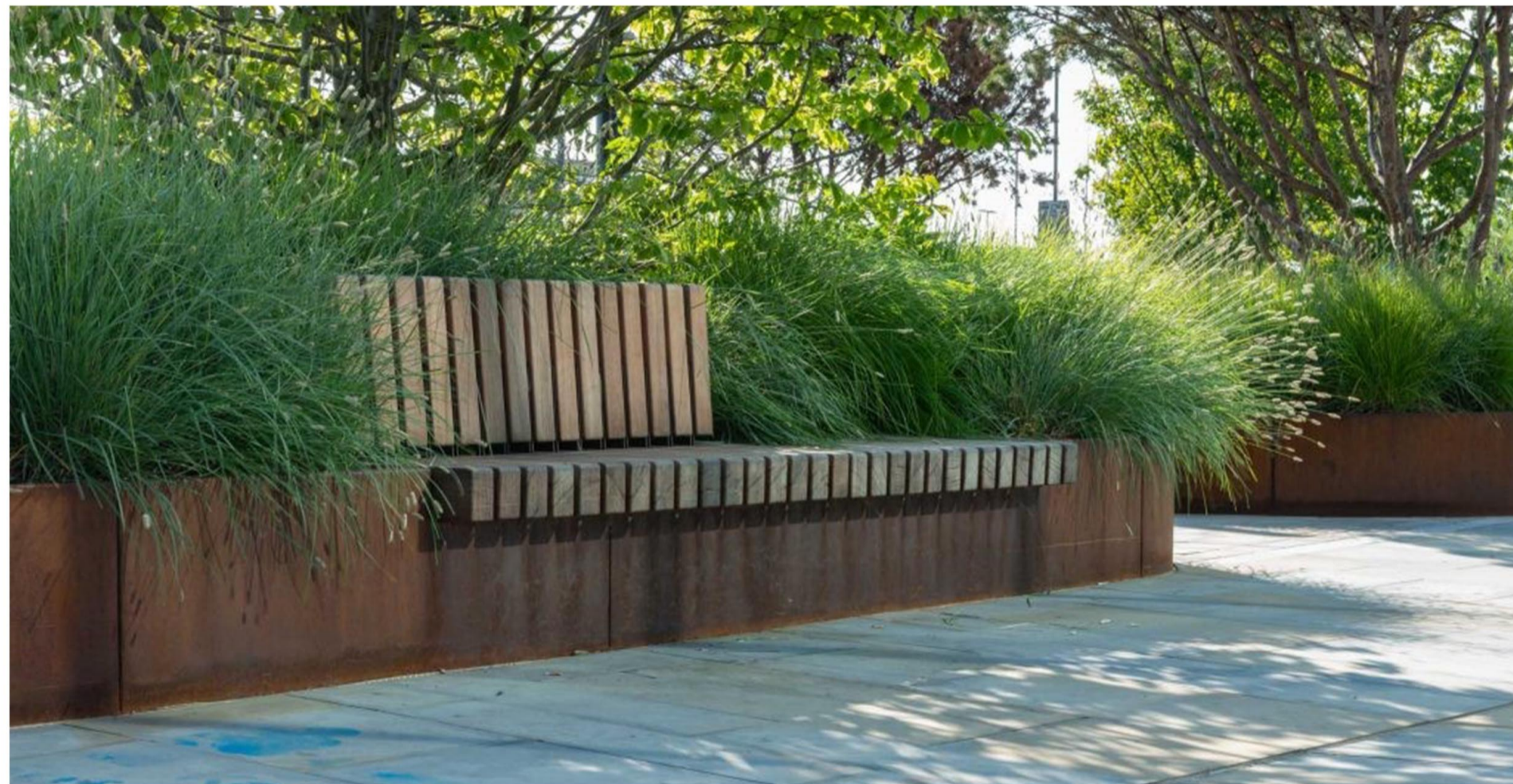
FT2. Planters: Woodscape, Corten steel planters with integrated seating or Equal and Approved.

NOTES: 1. Do not scale off this drawing 2. Drawing to be read in conjunction with the specification and all relevant drawing information. 3. Contractor to check all dimensions on site. McIlwaine Landscape Architects to be advised of any discrepancies between this drawing and site conditions immediately. 4. Dimensions are in millimetres unless otherwise stated. This drawing has been produced for the client for the project on the site shown. It was prepared for a purpose agreed with the client and will have a commensurate degree of accuracy. It is not a "record drawing". This drawing is not intended for use by any other person or for any other purpose than that specified here. McIlwaine Landscape Architects accept no liability whatsoever if this drawing is used by any other person or for any other purpose. © McIlwaine Landscape Architects. All rights reserved