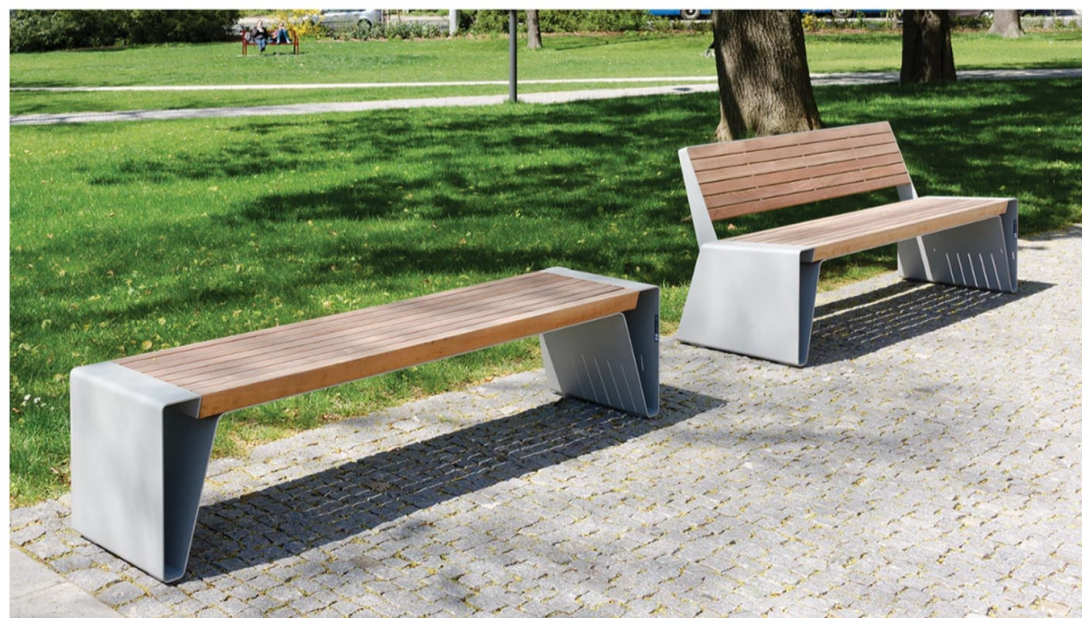
FT3. Furniture: Bench (Image for Illustration purposes only: 2 types of benches with combination of backrest and armrests to cater for all abilities- Woodscape or MMCITE or Equal and Approved.