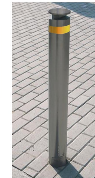
FT10. Fixed Bollard (To be stainless steel / with visibility band).