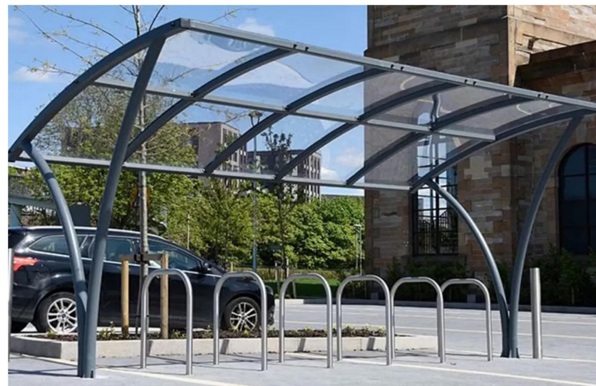
FT6. Cycle Shelter: - Broxap / polyester powder coated colour to match architectural metalwork- 6m long.