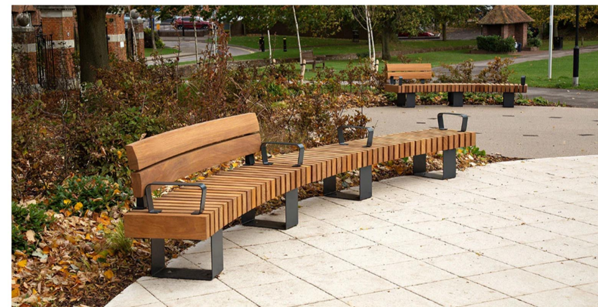
FT4. Furniture: Bench (Image for Illustration purposes only: 2 types of benches with combination of backrest and armrests to cater for all abilities- Woodscape or MMCITE or Equal and Approved.