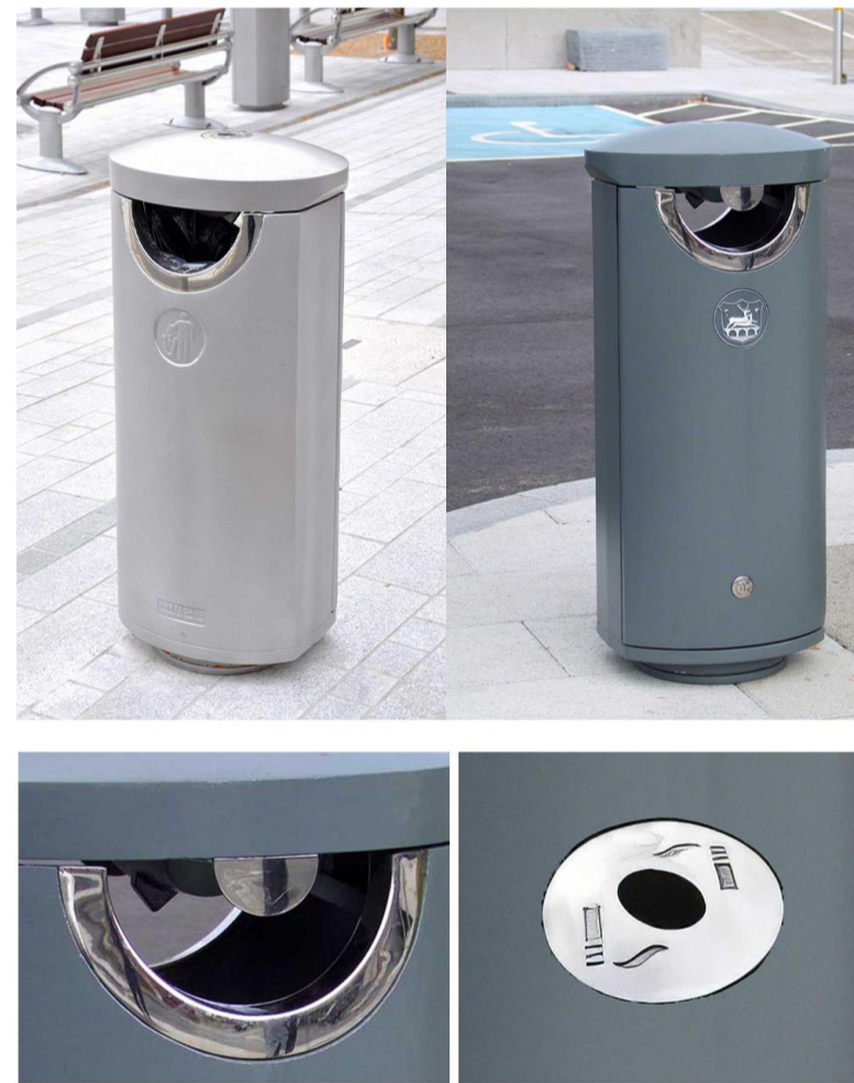
FT7. Litter Bins: Hartcaste or Equal and Approved.