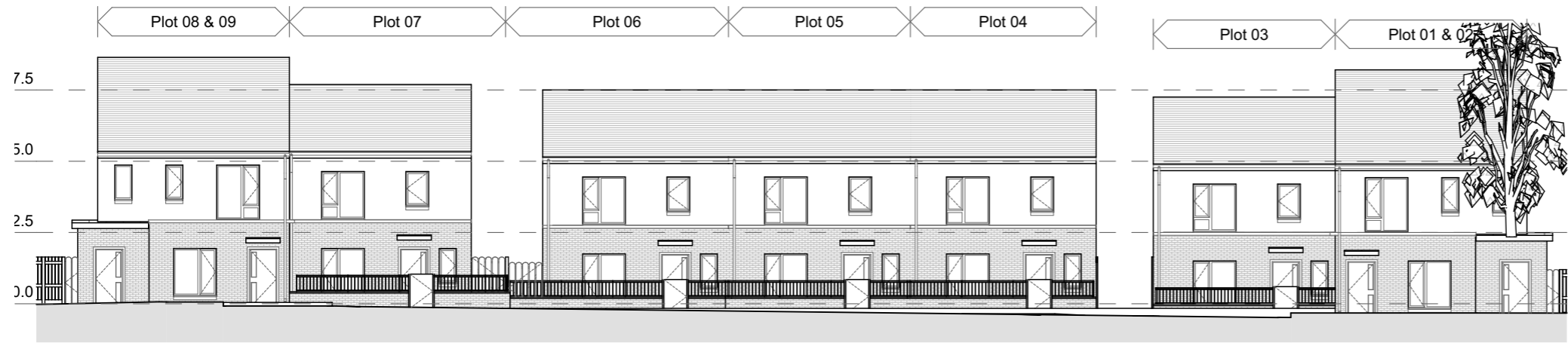
1 Street Elevation 01 1:200