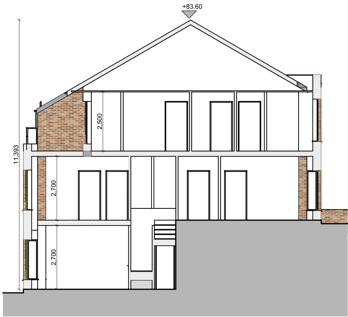
Block B - Proposed Section S-03