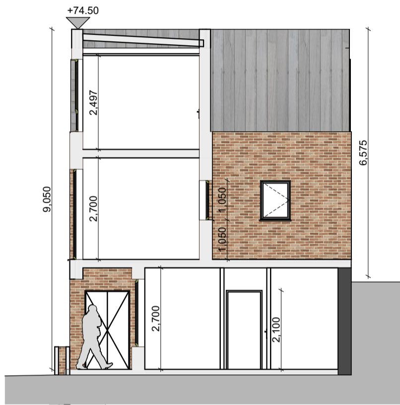
Block - A Proposed Section S-01 1:100