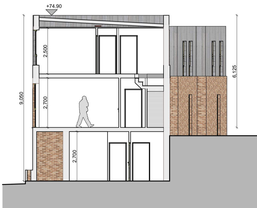
Block A - Proposed Section S-02