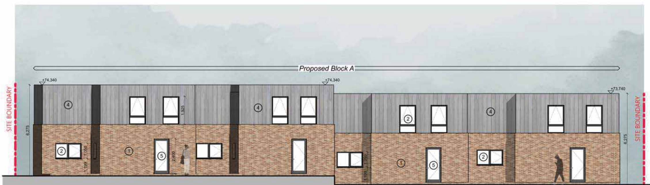
E-03 ELEV-03 Proposed Rear Elevation 1:150