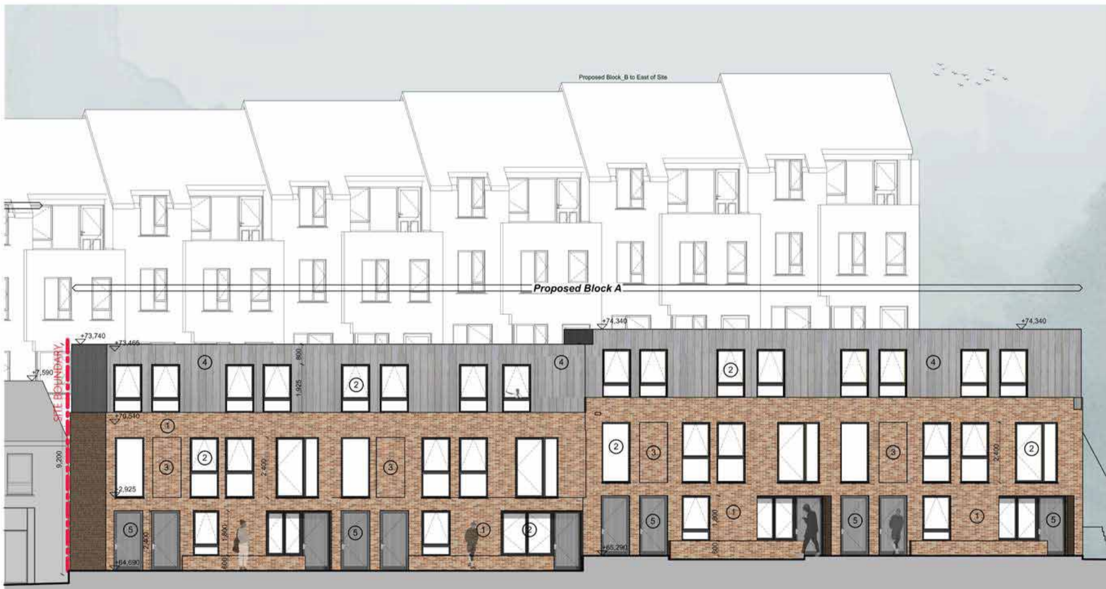
E-01 ELEV-01 Proposed Front Elevation Facing onto James Connolly/Dublin Road 1:150