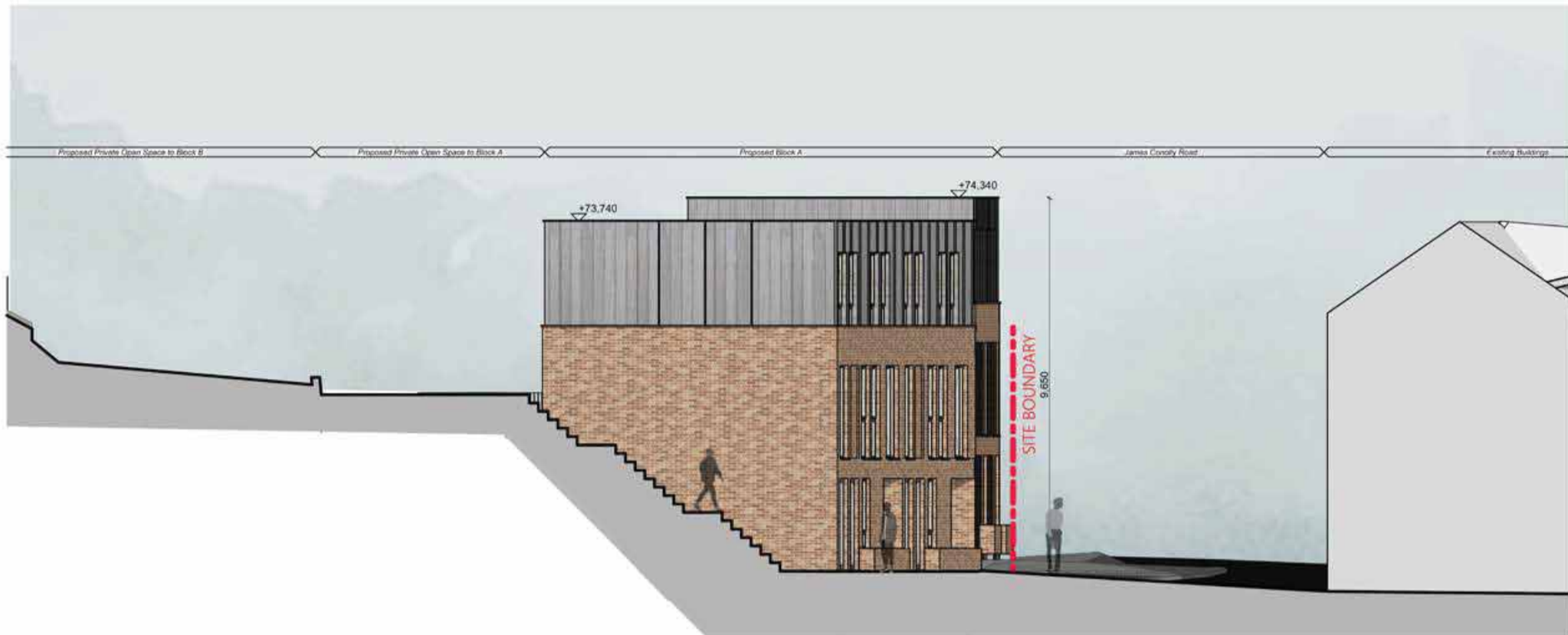
E-02 ELEV-02 Proposed side Elevation 1:150