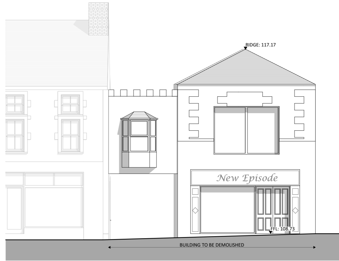
Building no 2 - Road Elevation (East) 1:100