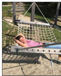
TP15 - Hammock - Image 01 NTS