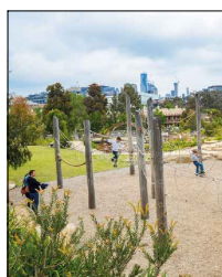
TP12 - Climbing Forest - Image 01 NTS