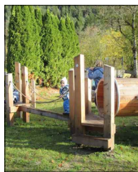
TP10 - Totter Trail - Image 01 NTS