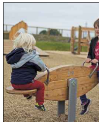
TP08 - Pairs Game - Image 01 NTS