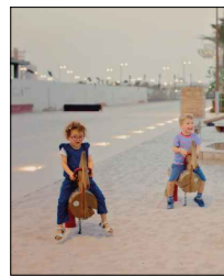
TP07 - Swinging Horse - Image 01 NTS