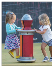
TP05 - Whirling Knight - Image 01 NTS