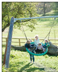
TP01 - Cradle Nest Special - Picture 01 NTS