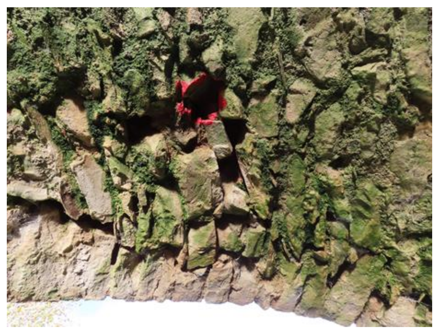
Photo 11 – crevice marked for retention for bats close to upstream face of eastern arch