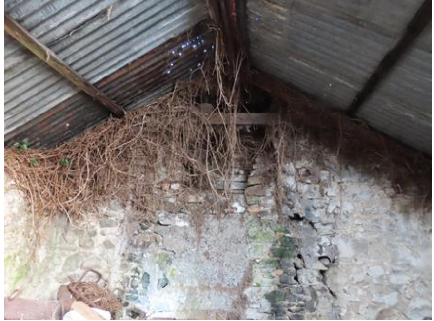
Photo 21 - crack in stonework of gable wall – ideal roosting site for bats