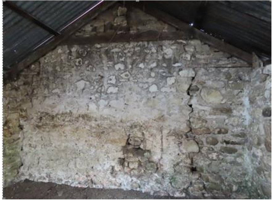
Photo 20 – crack in stonework of gable wall – ideal roosting site for bats