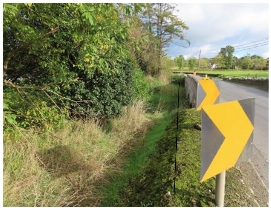
Photo 3 – position of proposed walkway to north of bridge structure