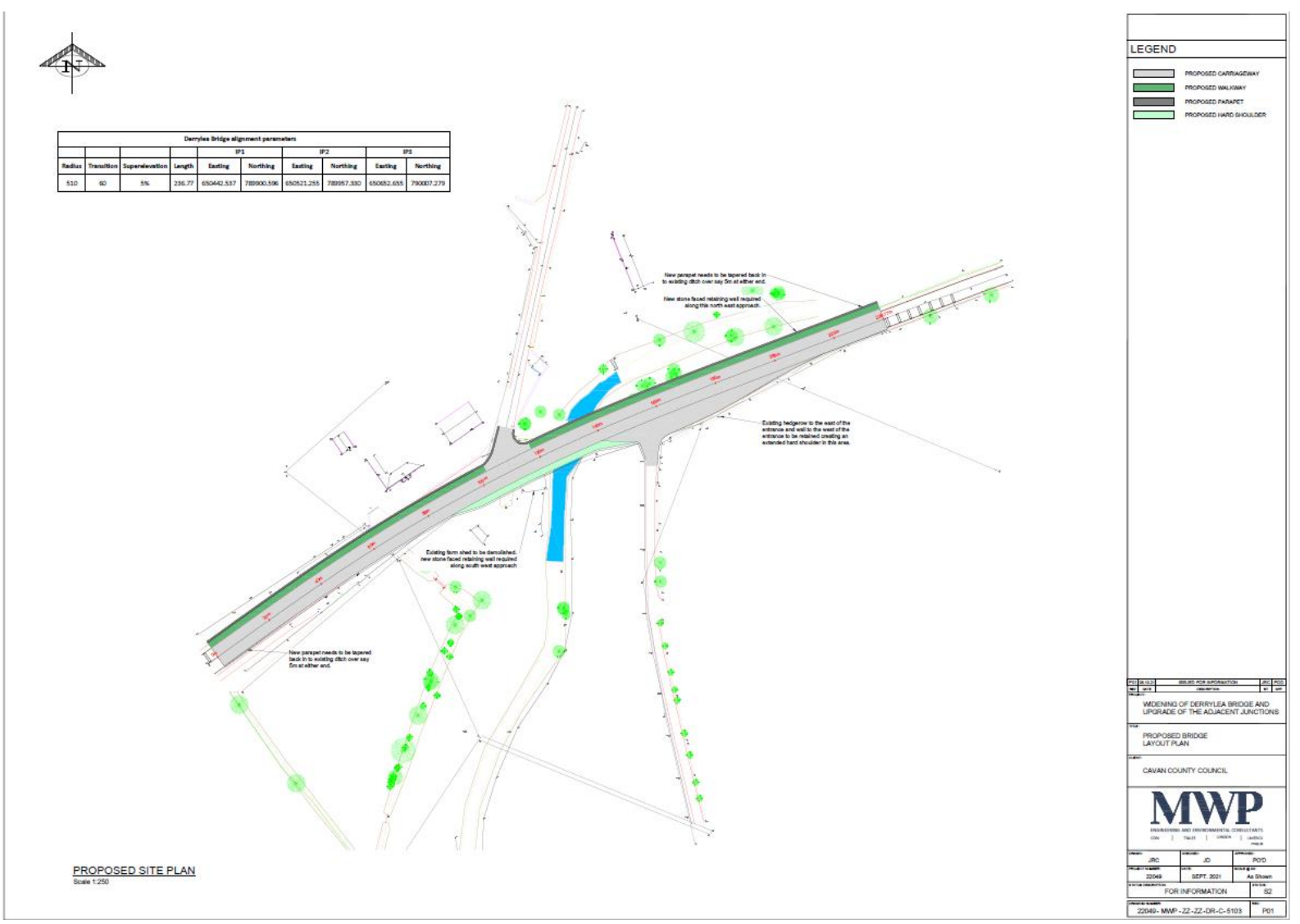
Figure 4 – proposed new alignment at Derrylea Bridge