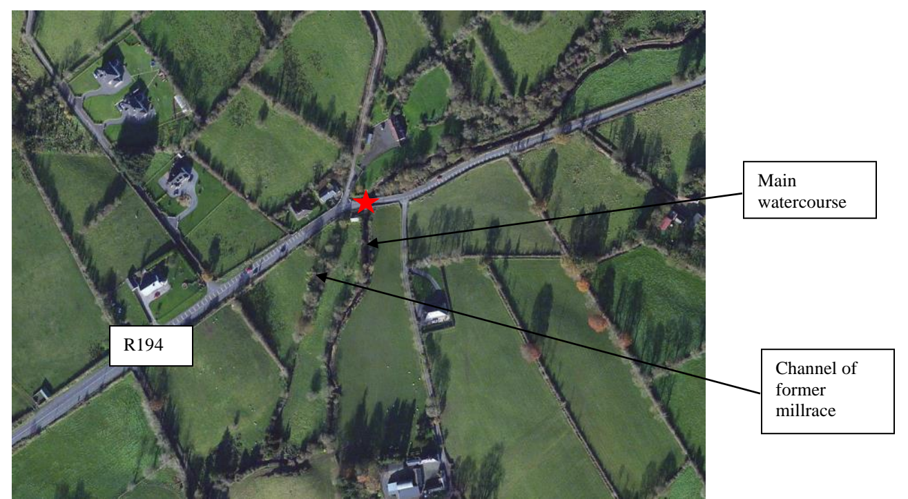
Figure 1 – aerial photo showing the location of Derrylea Bridge.

Bridge Name: Derrylea Bridge Grid Reference: Y 289953 X 250613 Watercourse: Claddagh River Species recorded: None