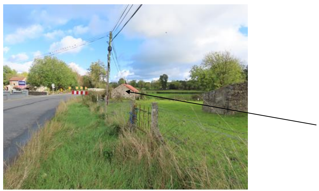
Photo 1 – looking north east towards Derrylea Bridge. Small stone shed to be demolished is indicated