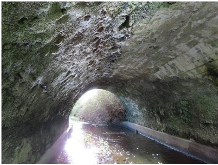
Photo 13 – grout and shuttered concrete sealing the undersurface of the western arch