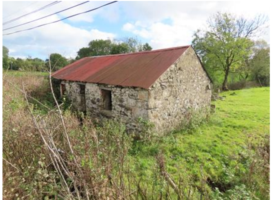
Photo 18 – farm shed on western side of river which will be demolished to accommodate road widening