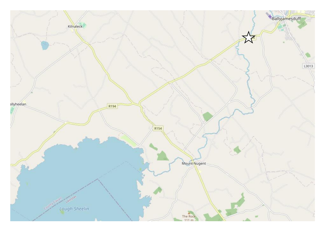
Figure 3 - Map showing distance from Derrylea Bridge to Lough Sheelin