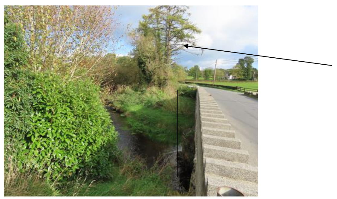
Photo 4 - position of proposed walkway to north of bridge structure (upstream). Several conifer (fir) trees to be felled on east side of bridge