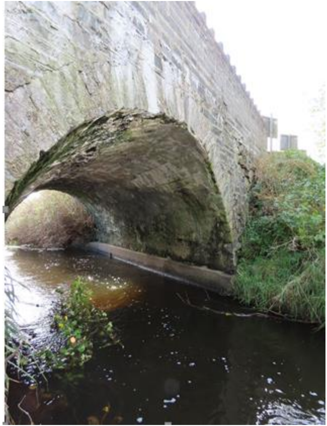
Photo 12 – grout and shuttered concrete sealing the undersurface of the western arch