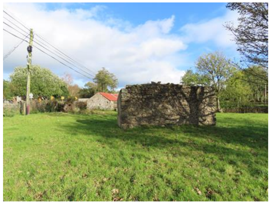
Photo 17 – Two stone buildings on western downstream side of river