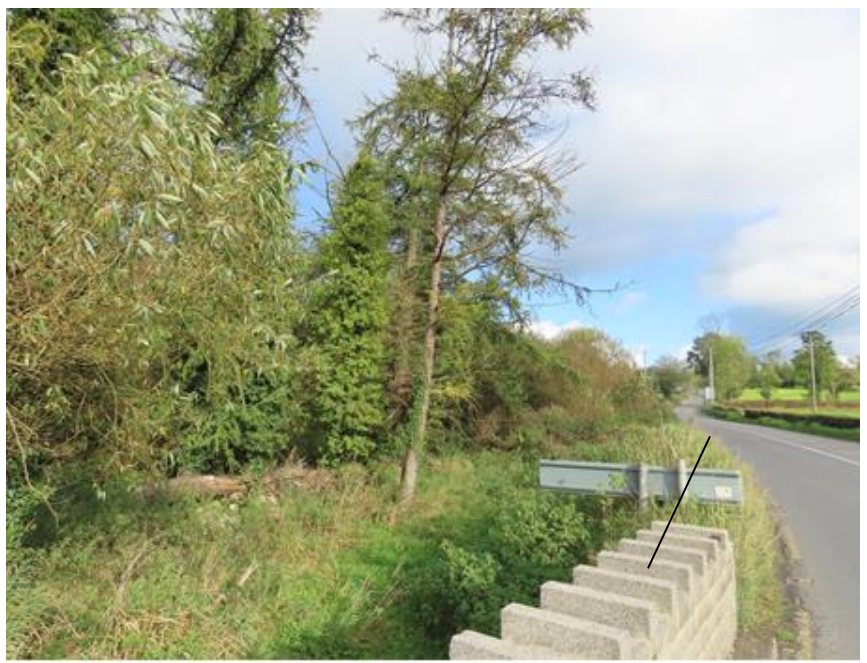
Photo 5 – eastern side of bridge – location of proposed walkway indicated