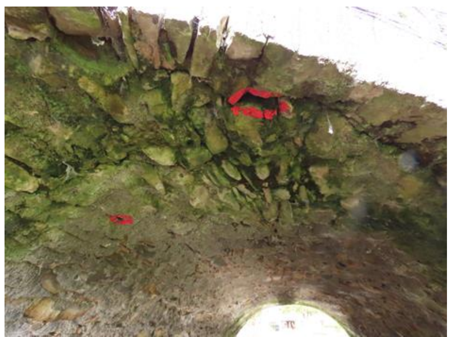
Photo 10 – two crevices marked for retention for bats close to downstream face of eastern arch