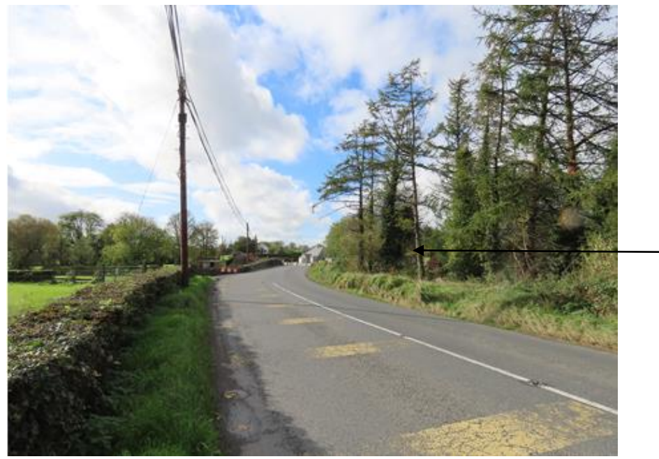
Photo 7 – looking west across bridge – several conifer fir trees to be felled for proposed walkway