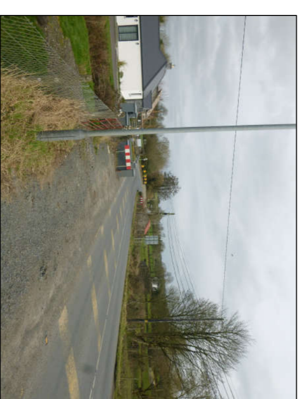
LOOKING EAST OVER BRIDGE