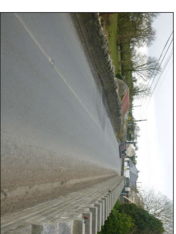
LOOKING WEST OVER BRIDGE