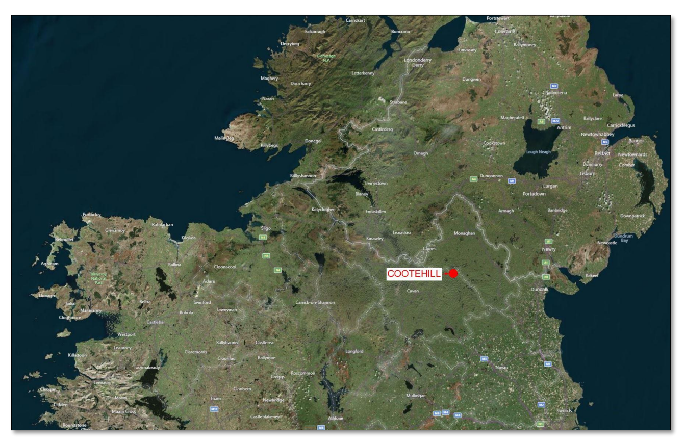
Fig. 1.1 - Development Location - Cootehill, Co.Cavan

The proposed development is for the outline of 5 no. fully serviced sites for future enterprise units including new service road accessed via Cootehill Enterprise Park, street lighting, upgrade of existing site services including connections to services, boundary treatment & landscaping.