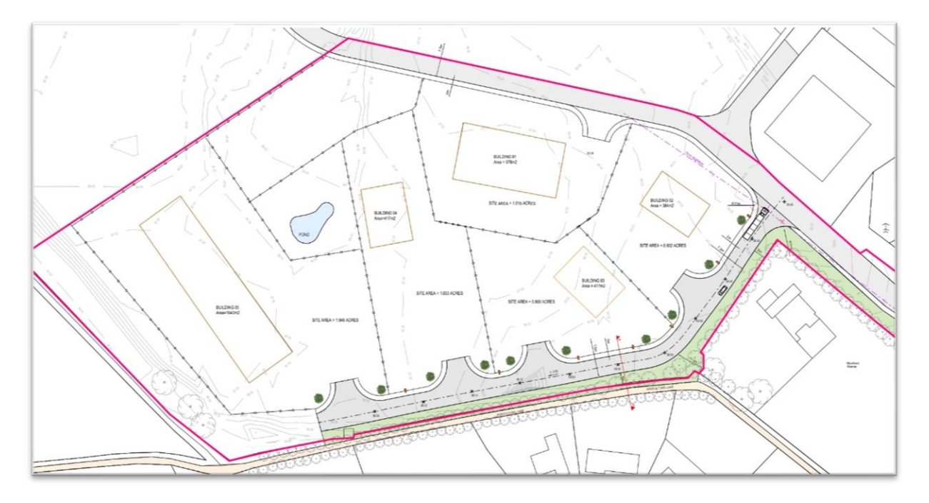
Figure 1.3 - Site Plan of the proposed service road