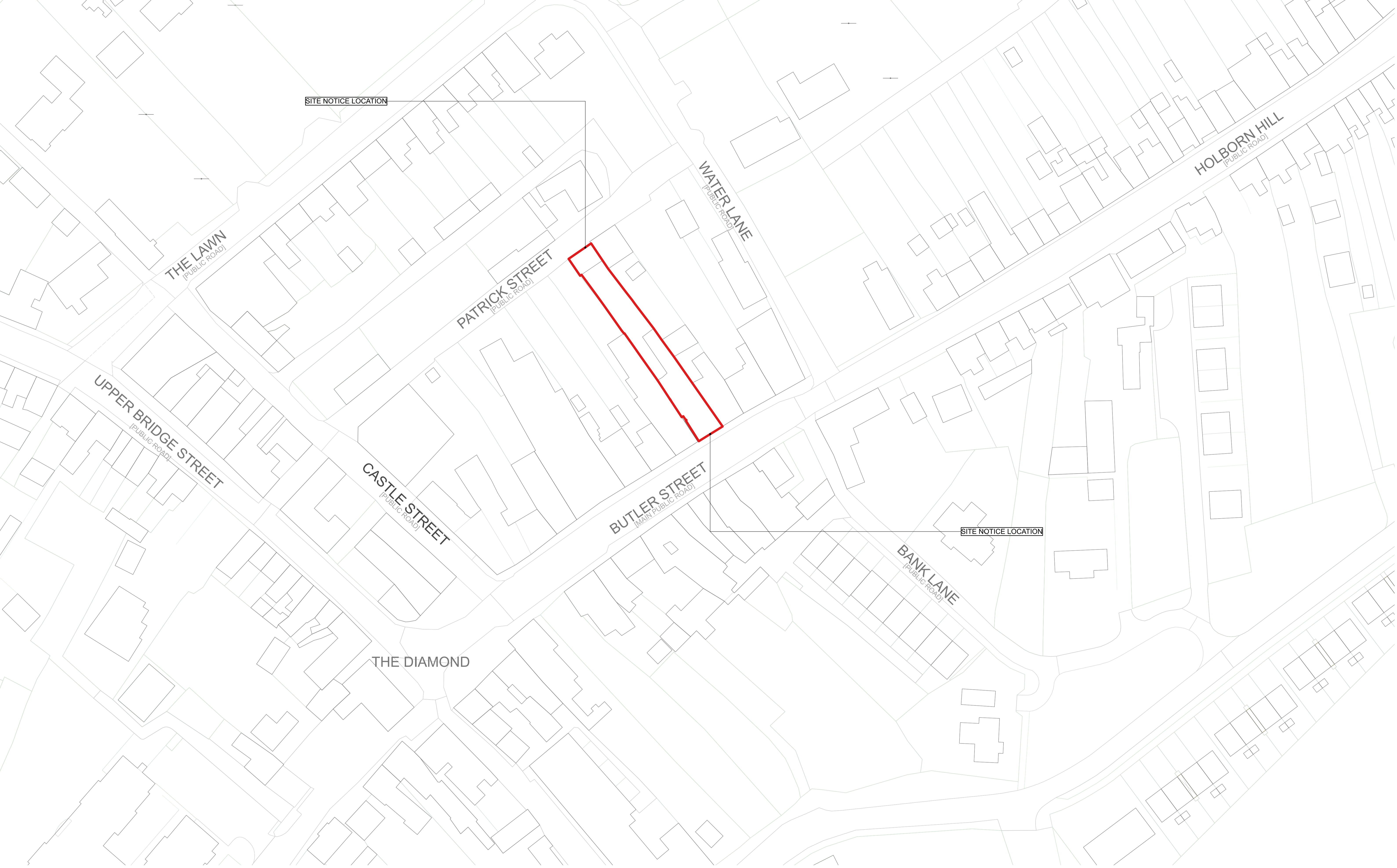
Site Location (OS) Map 01 Scale: 1:500