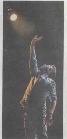
'Unguarded' comes to the Ramor Theatre later this month.

To book, visit ramorthatre. ticketsolve.com or book through the box office in person or by phone on 049-8547074, Monday to Friday, between 10am and 4pm.