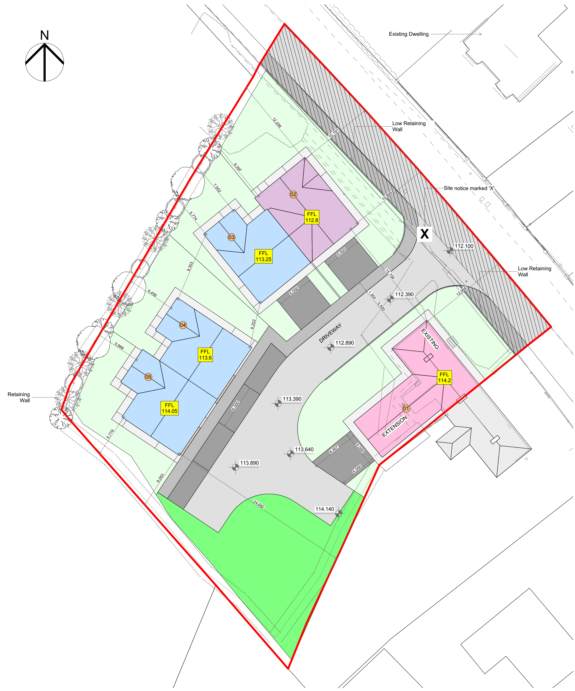
1 Site Layout 1:250