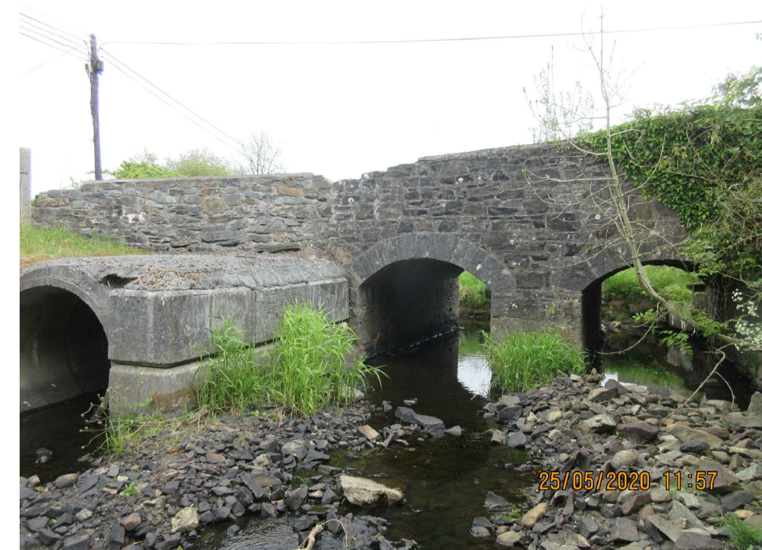
PIC 2; DOWNSTREAM ELEVATION