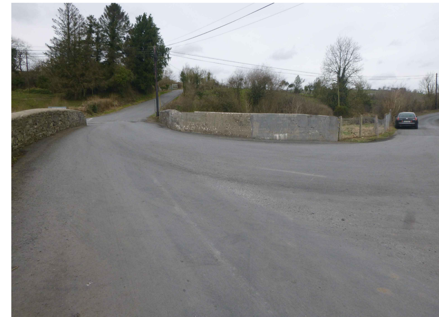
PIC 3; VIEW LOOKING WEST