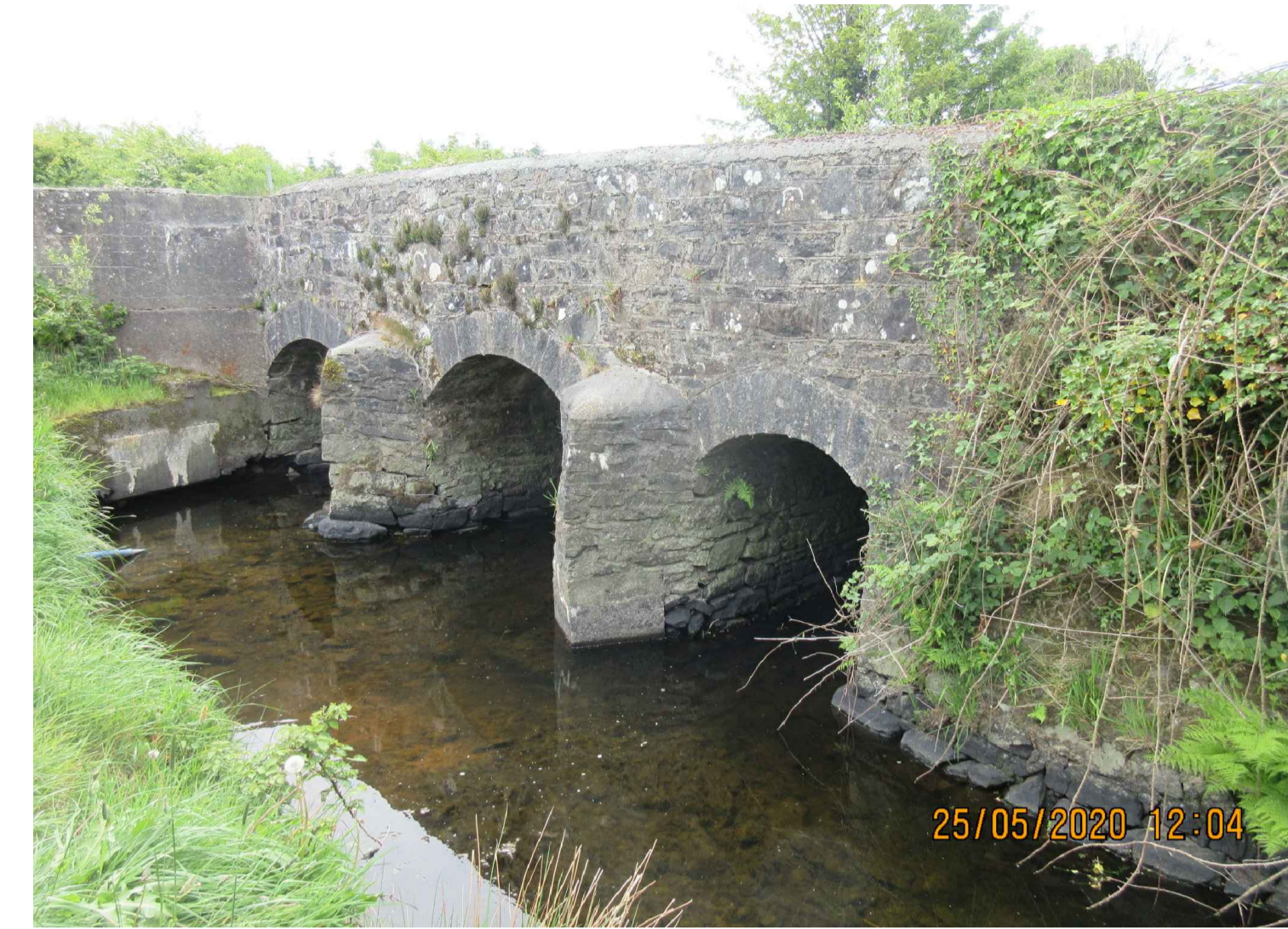
PIC 1; UPSTREAM ELEVATION