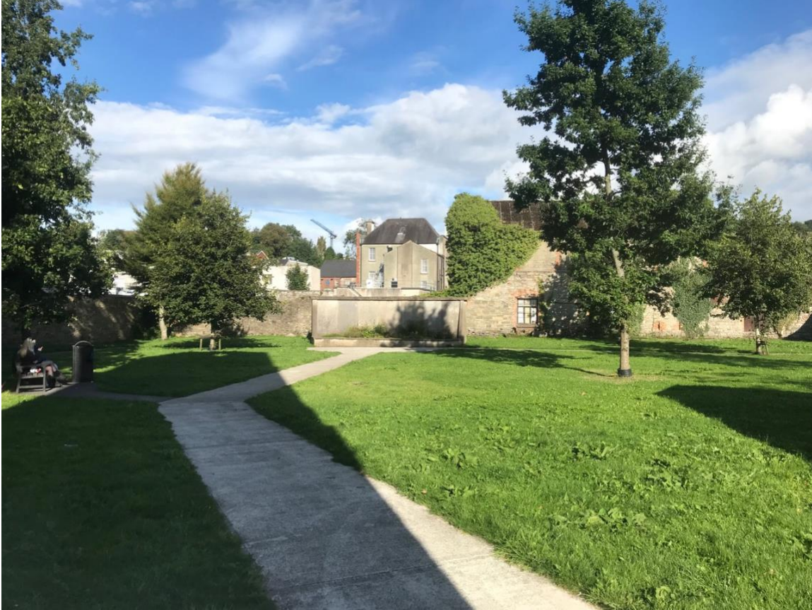
Existing parkland at the former Abbey Graveyard (September 2022).