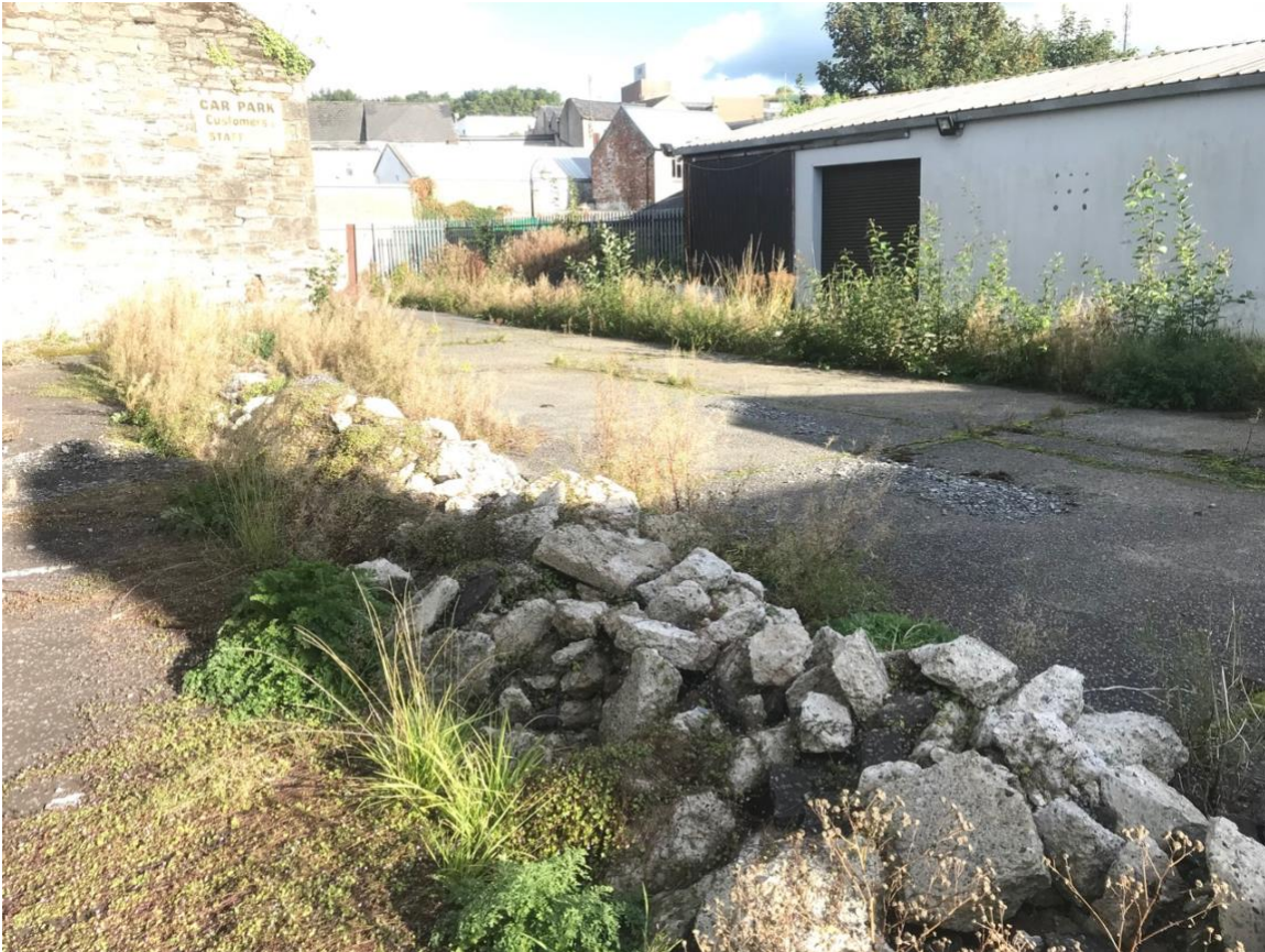
Recolonising bare ground at archaeological trenches within the Abbey backlands.

Portions of the site where the hard ground has been disturbed are frequently colonised by wild plant species. Recorded in such areas were Ragwort ( Senecio jacobaea ), Feverfew ( Tanacetum parthenium ), Dandelion, Coltsfoot ( Tussilago farfara ), Smooth Sow-thistle ( Sonchus oleraceus ) and Willow-herbs. Some tree seedlings of Willow ( Salix spp) and Sycamore ( Acer pseudoplatanus ) also occur occasionally here.