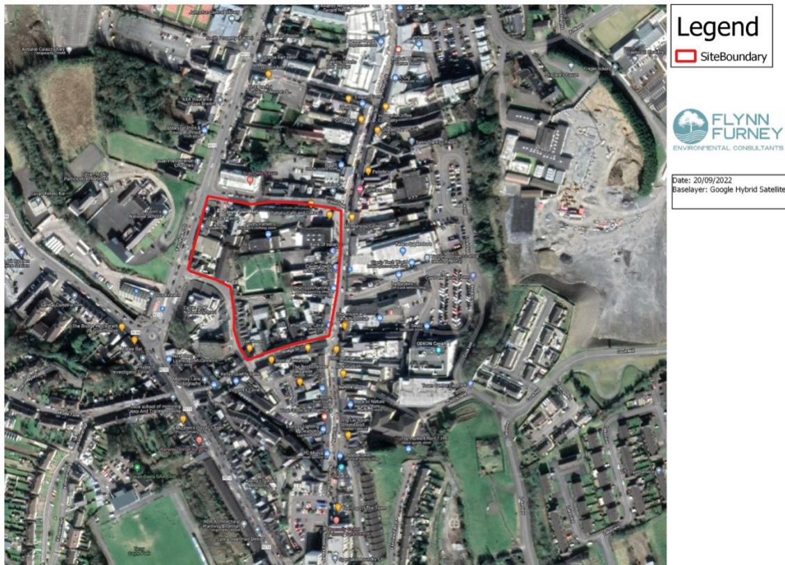
Fig. 1. Site boundary shown by red line.

Ecological field surveys of the proposed development site were carried out on the 9 th and 13 th September 2022. A previous site survey was carried out in March 2019. Habitat survey and mapping followed the Heritage Council's Best Practice Guidance (Smith et al. 2011). Habitats were classified according to the Heritage Council's Scheme (Fossitt, 2000). A map indicating the location and extent of the site as well as surrounding landscape is given in Figure 1.