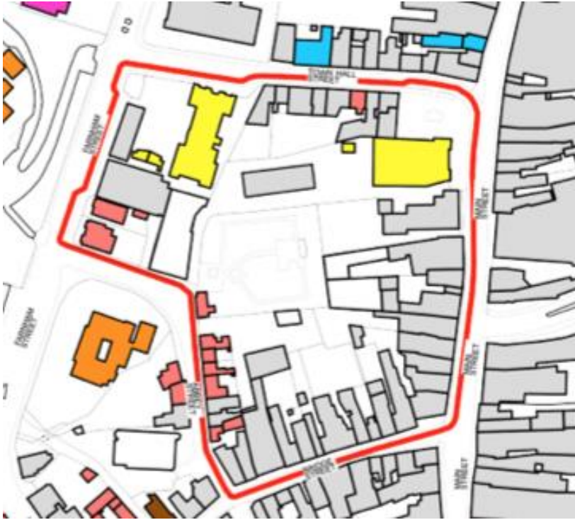
Fig. 1. General extent of scheme indicated within the red line.