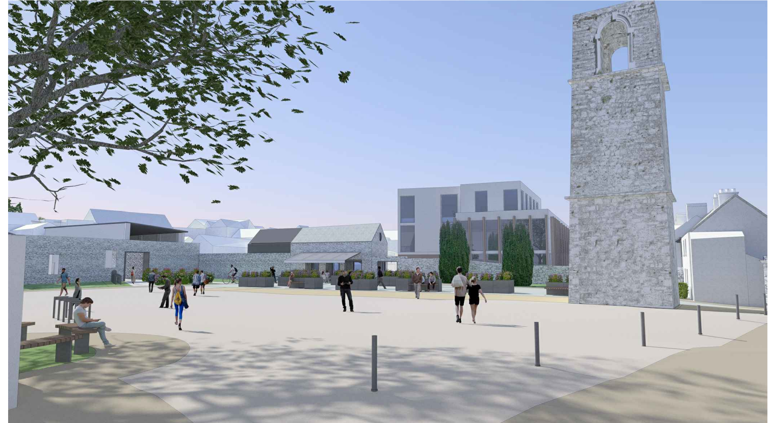
PUBLIC REALM VIEW 3 From Bank of Ireland

PUBLIC REALM VIEW 2 From McIntyre's Building