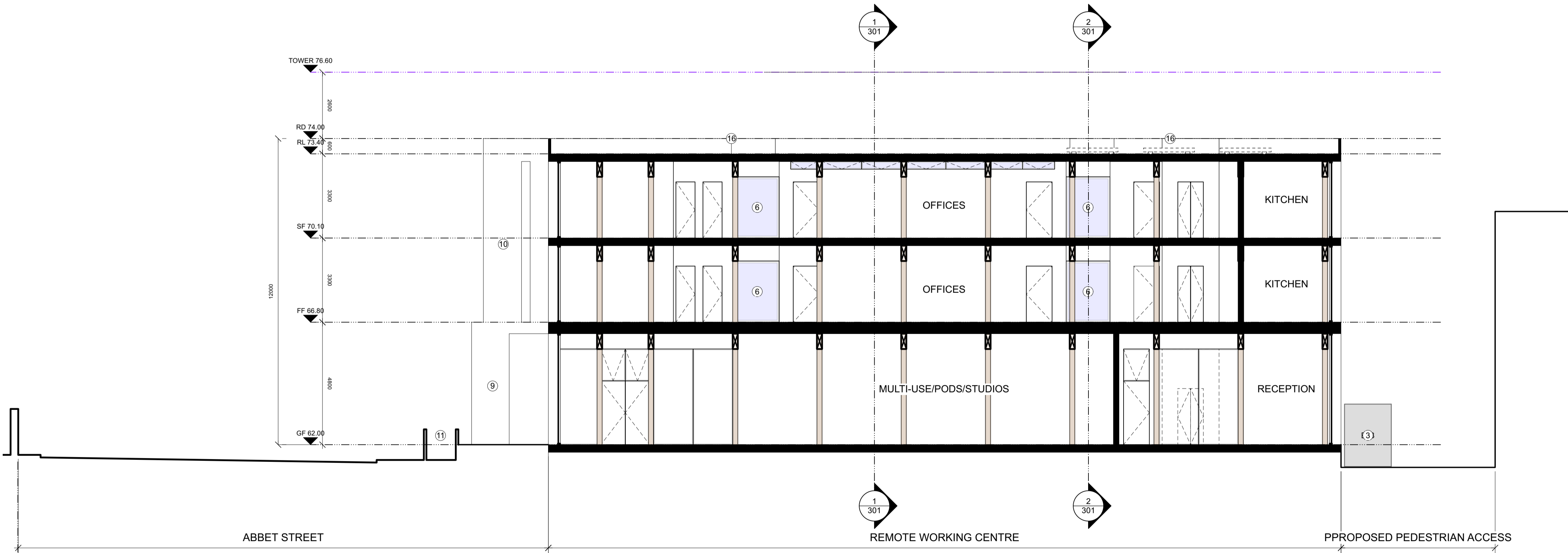
3 Proposed Section PP.301 Scale: 1:100

ALL MATERIALS AND FINISHES SHOWN ARE SUBJECT TO DETAIL DESIGN