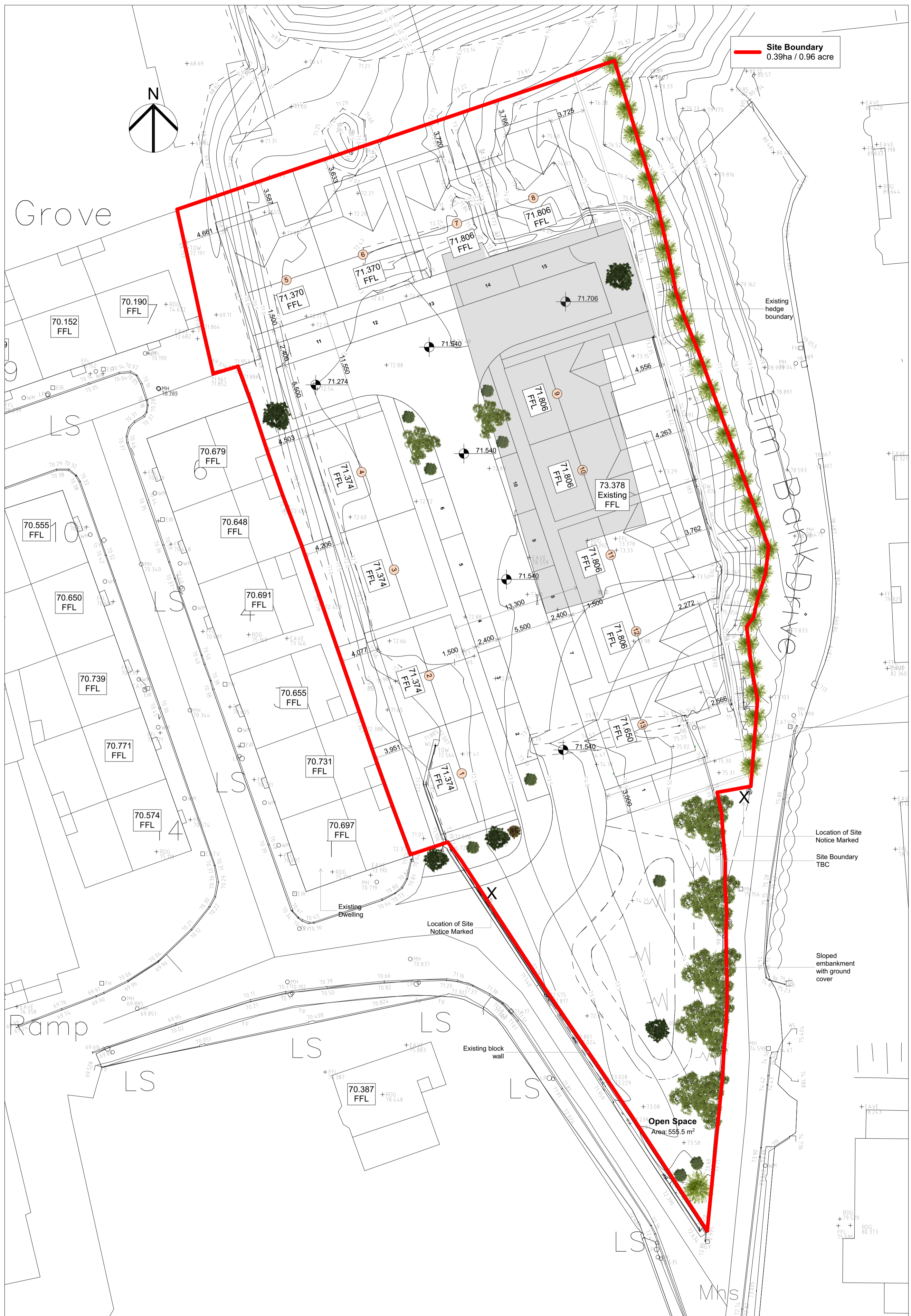
Proposed Site Layout - Survey