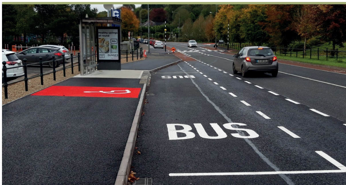
Fig 7.1 New bus bays, cycle path & pedestrian crossing at Cavan Institute of Technology 2019

This sets out design standards for urban roads and streets, which balances the ‘place function’ (i.e. the needs of residents and visitors) with the ‘transport function’ (i.e. the needs of pedestrians, cyclists, public transport, cars and goods vehicles). The manual gives guidance on the layout of new developments (with a view to maximising permeability for sustainable modes), and on the design of individual roads and streets taking into account streetscape and urban design as well as engineering. The focus is on providing streets that are good places to live, work and play in, while providing appropriate capacity for pedestrians, cyclists, public transport and cars. The use of the Manual is mandatory for all Local Authorities.