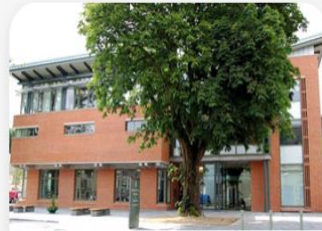
Johnston Central Library Cavan Town