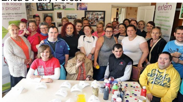
Extern Traveller Project