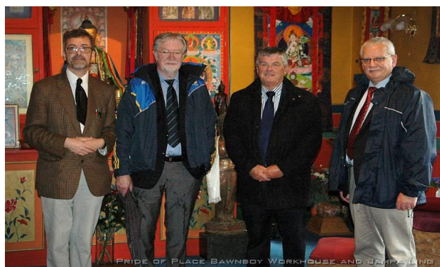
Judges visit to Jampa Ling Buddhist Centre, Bawnboy