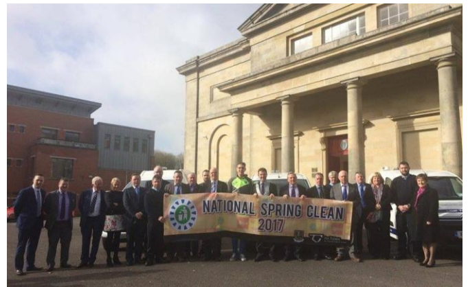
Launch of 'National Spring Clean' Week Cavan in March.

Community & Enterprise Department Cavan County Council Courthouse Cavan