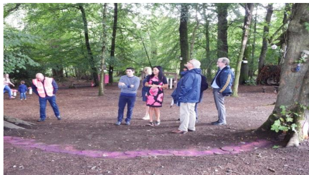
Erica's Fairy Forest