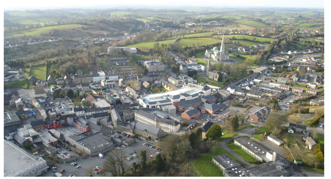
Current Aerial View of Cavan Town Core