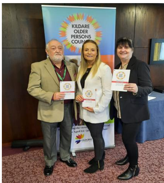
Kildare Older People's Council AGM happened on Wednesday with over 70 people in attendance.