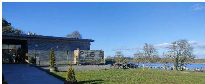
Picture 3 shows the beautiful venue for the Roscommon Memory Café meet ups, Lough Key Forest Park.