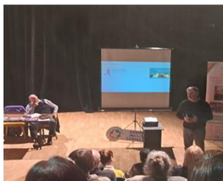
Cavan Dementia Inclusive Community Initiative took place this week.