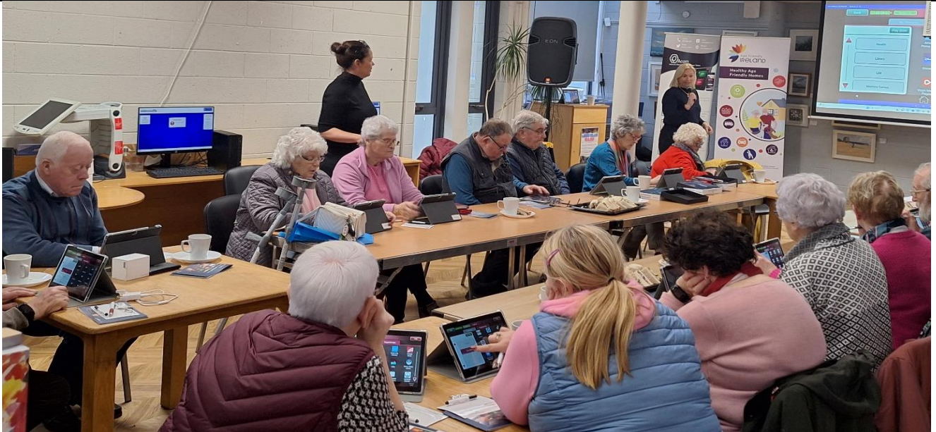
Photo 2: ACORN Age Friendly Tablet Training, Longford Library, Longford Town- workshop participants.

If you would like more information on the Healthy Age Friendly Programme you can visit https://agefriendlyireland.ie/category/healthy-age-friendly-homes-programme/introduction/ or phone our national office at 046 9248899