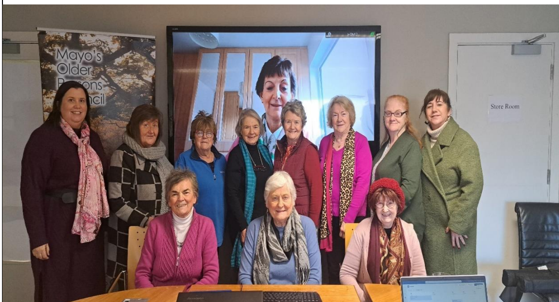
Mayo's OPC Executive

At last meetings of 2023 both the OPC Executive and Age Friendly Alliance agreed and look forward to delivering new actions and initiatives under the Age Friendly Programme for Q1 2024.