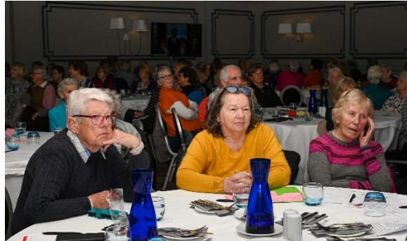
Members of Kilkenny OPC attending its Celebration Conference.

For the first time in three years Kilkenny Older Peoples Council (OPC) held its conference in the Age Friendly Ormonde Hotel on Tuesday 1 st November. Over 170 members and 30 guests attended the celebration of Kilkenny Older Peoples Council contribution to the first decade of the Kilkenny Age Friendly Programme. A special effort was made this year to encourage new members to attend and to ensure a wider representative group from all geographical areas of the County, It was the first time for many to attend such an event.